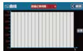
Data Curve Viewing