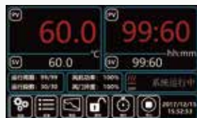
Operating Main Interface