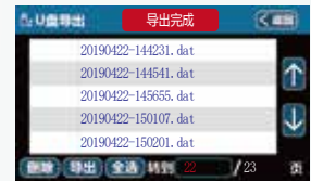
USB Export Interface